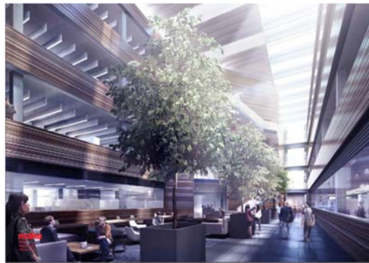
Architect's impressions of the Big Data Institute atrium