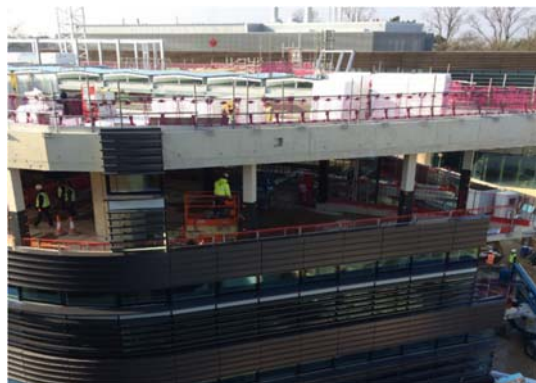
Construction work on upper levels and façade of the Big Data Institute (Feb 2016)